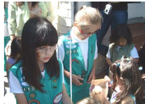
Girl Scout Troop 4101 coordinated children's activities & donated diapers