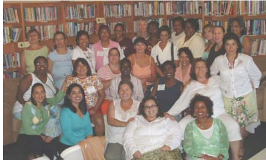
Lotus Project Participants and Facilitators